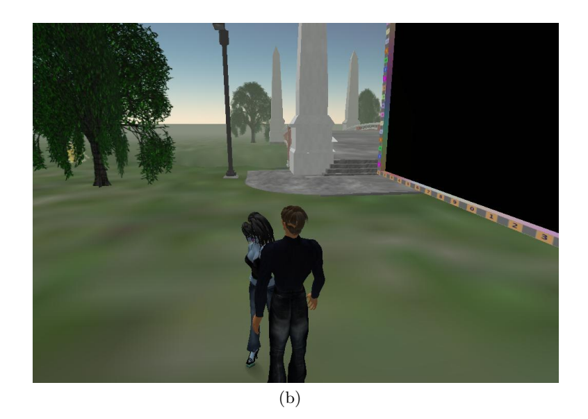
Fig. 3. (a) Screenshots of two avatars interacting: (a) social distance — approximately 5 meters, and (b) personal space — approximately 1 meter.